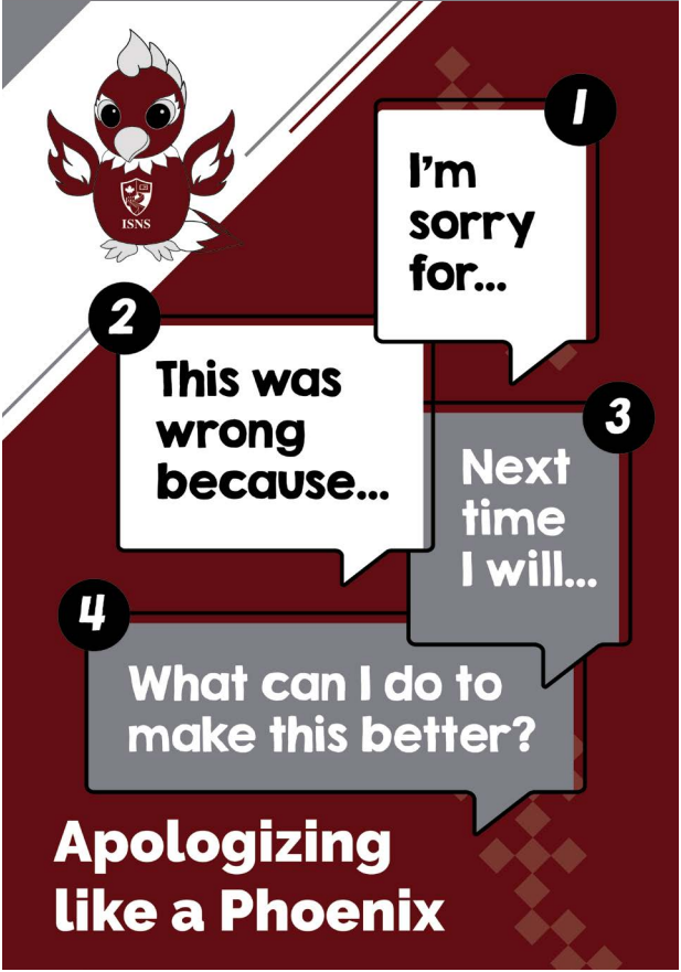
3. Phoenix Apology:

Children can use this message to express their feelings. They can listen to other people involved in a conflict share their feelings, as well. This tool builds empathy and understanding of perspective.