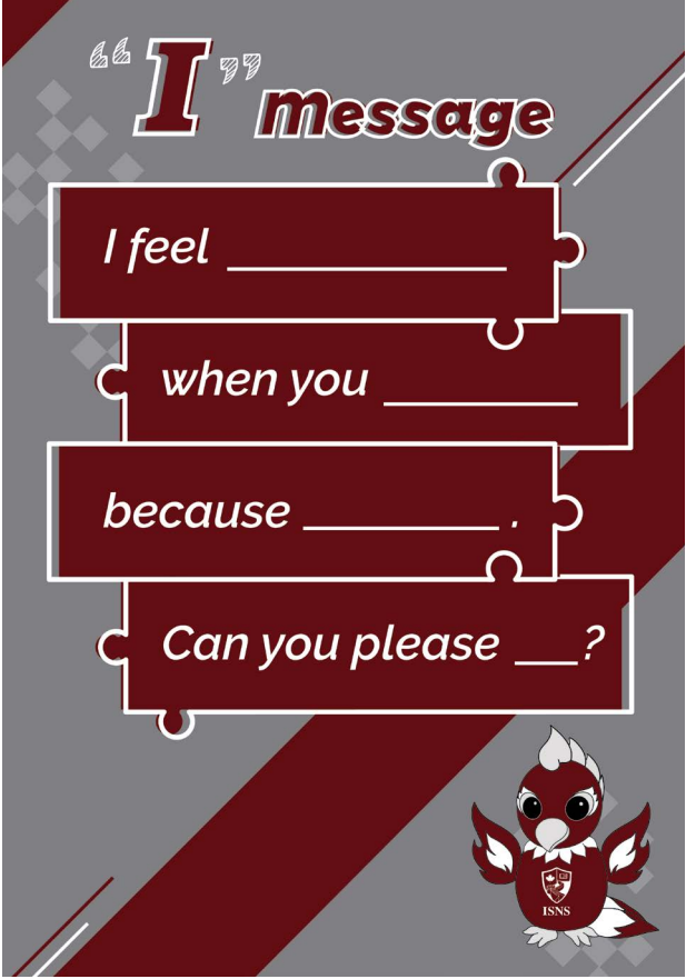
2. I Message:

Children can use this tool to find alternatives to harmful expressions of sadness, anger or frustration.